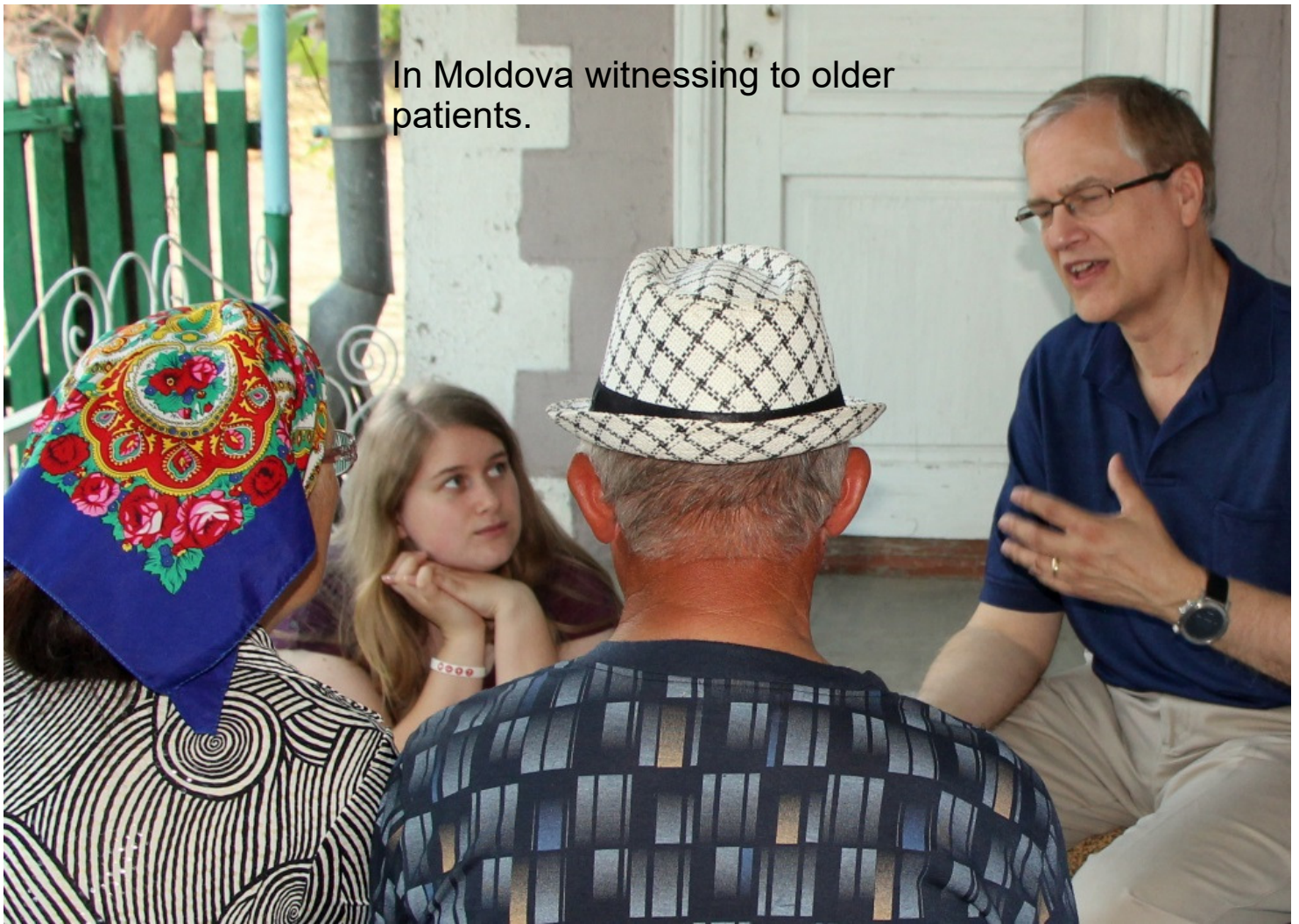
In Moldova witnessing to older patients.