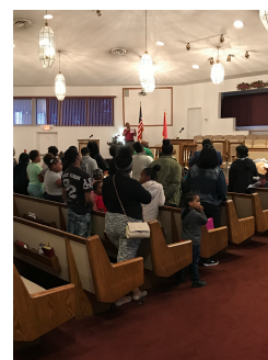
First night at New Sardis Baptist Church